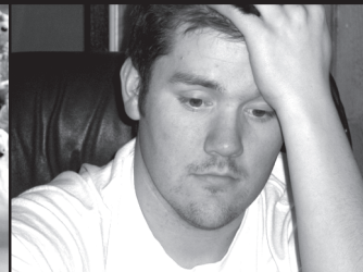
Les Beldo: providing Thirdeye with deep thought since issue 007.