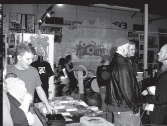
Our one year party went off with out a hitch until our bartender made friends with the floor.