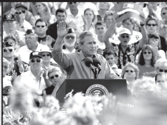
Bush gets sweaty during his visit to Traverse.