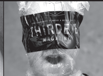
Whoops! Our artistic expression forced some parents to actually parent. Issue 019's cover got Thirdeye banned from more than one establishment.