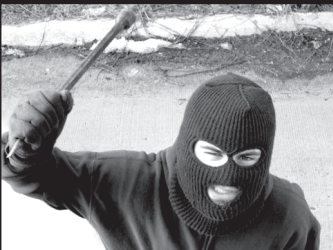
These kinds of photo shoots can be a bit nerve-racking with the Detroit cops having full metal jackets and all.