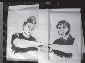
Precursor of Andrew's illustration on the cover of issue 014. THUG-NASTY!