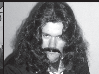
Les Beldo: editor, rock star, or international man of mystery?