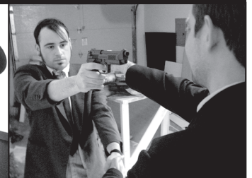
Economic hitmen can be brutal. No, officer, the guns aren't real.