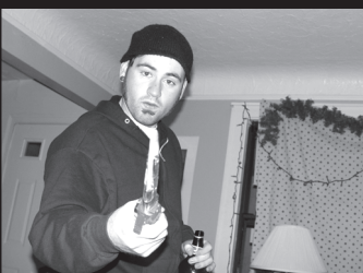
After being found on the streets of Detroit. The Power Rangers sword of justice became a regular staple around the TE office. Sound effects kickass!