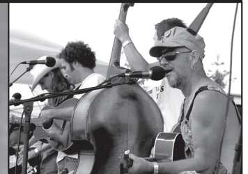
Taking break at Dungrass Festival to enjoy Greg Brown and Steppin' In It.