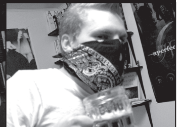
Here's to the end.